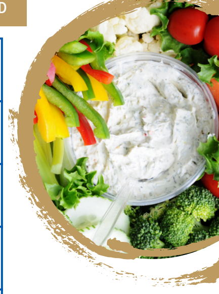
WE ARE HAPPY TO CUSTOMIZE YOUR MENU + SERVICES TO FIT WHATEVER NEEDS YOU HAVE TO MAKE YOUR ROYALS TAILGATE A SUCCESS!

PRICING DOES NOT INLCUDE: TAX, DELIVERY, GRATUITY OR 15% ADMIN FEE