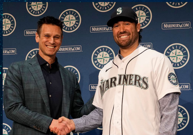
ROBBIE RAY – '21 AL CY YOUNG WINNER