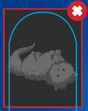
PHOTO FILE SPECIFICATIONS

Preferred photo file size is 1512 x 2016 pixel / 21" x 28" (72 dpi) in JPG / PNG format.