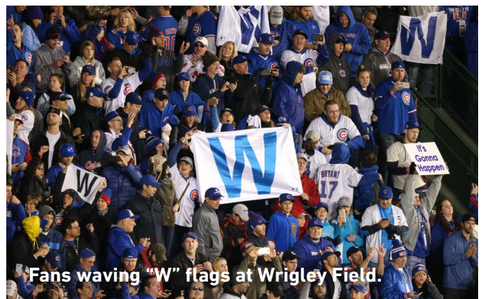
Fans waving “W” flags at Wrigley Field.