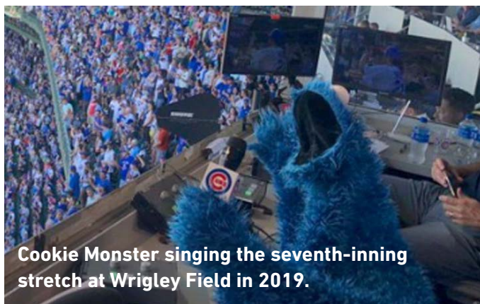
Cookie Monster singing the seventh-inning stretch at Wrigley Field in 2019.

Home Run: When the Cubs win, what color is the flag that is raised above the scoreboard? _____