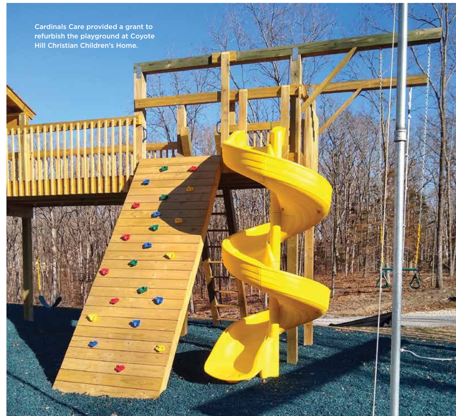
Cardinals Care provided a grant to refurbish the playground at Coyote Hill Christian Children's Home.

RECIPIENT COYOTE HILL CHRISTIAN CHILDREN'S HOME